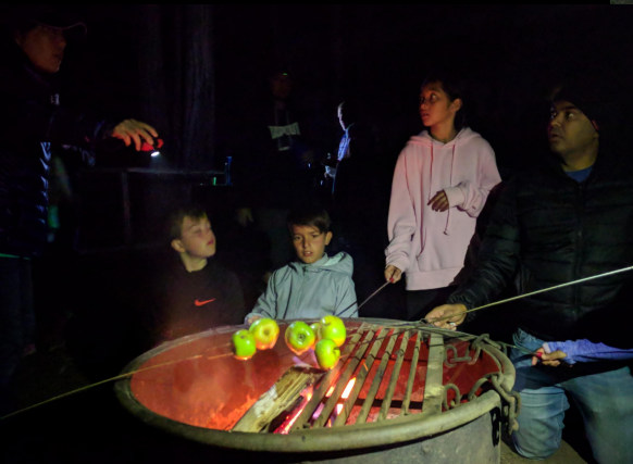
Manresa Camping Trip